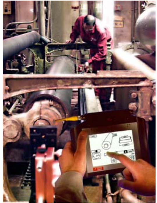
Roll parallel measurements being performed with the Fixturlaser Roll 200 by plant maintenance personnel.

The Fixturlaser Roll 200 is based on the Fixturlaser Platform providing full upgradability to existing and future products. Meaning your initial investment is always protected. The unique upgradability let you upgrade the Fixturlaser Roll 200 with capabilities for shaft alignment, or, if you already have a Fixturlaser Shaft-series you can upgrade to a Fixturlaser Roll 200 .